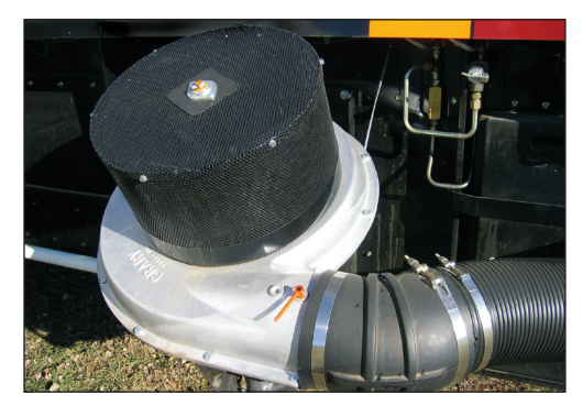
Also available is a combine mounted belt drive fan for some models of John Deere combines.